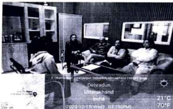
Interview for appointment of JRF in Collaborative Project