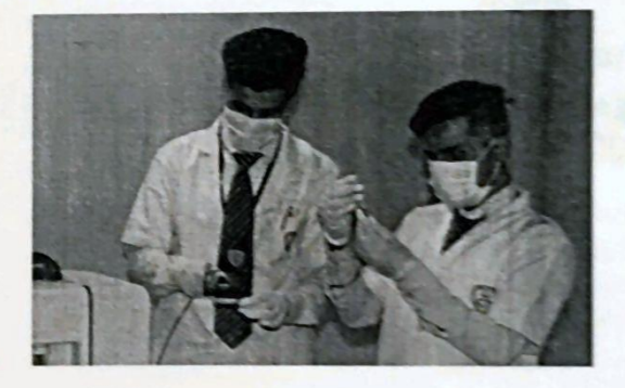
Head of Institute Dolphin (P.G.) Institute of Bio-Matical & Natural Sciences, Manauwale, Dehra Dun

The students shall be able to understand the principles of cell counter and be able to use the cell counter and analyze the report generated