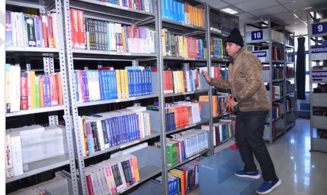
Plate 2: Investigation of the systems and facilities