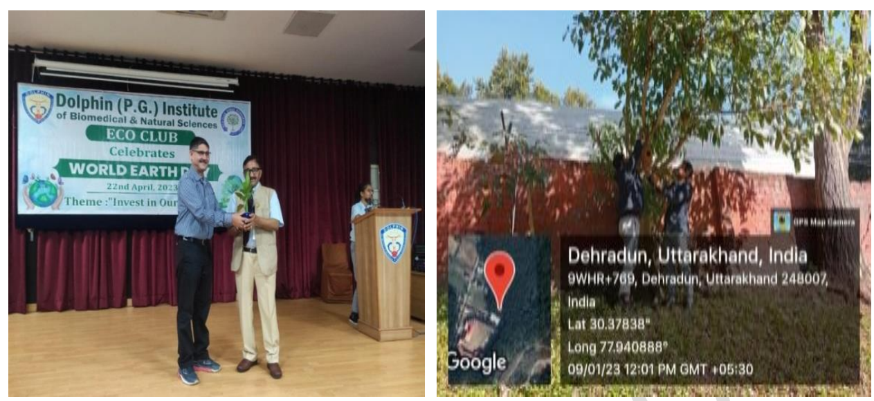
Plate 4:World Earth Day and Homing Sparrow and Birds programme