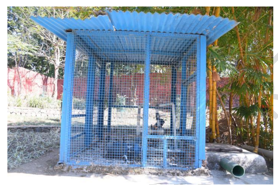
Plate 7: Bore well in the premises

The Institute uses the following sources of water supply for secondary usages such as watering plants, kitchen, toilets, and wash basins and other spaces.