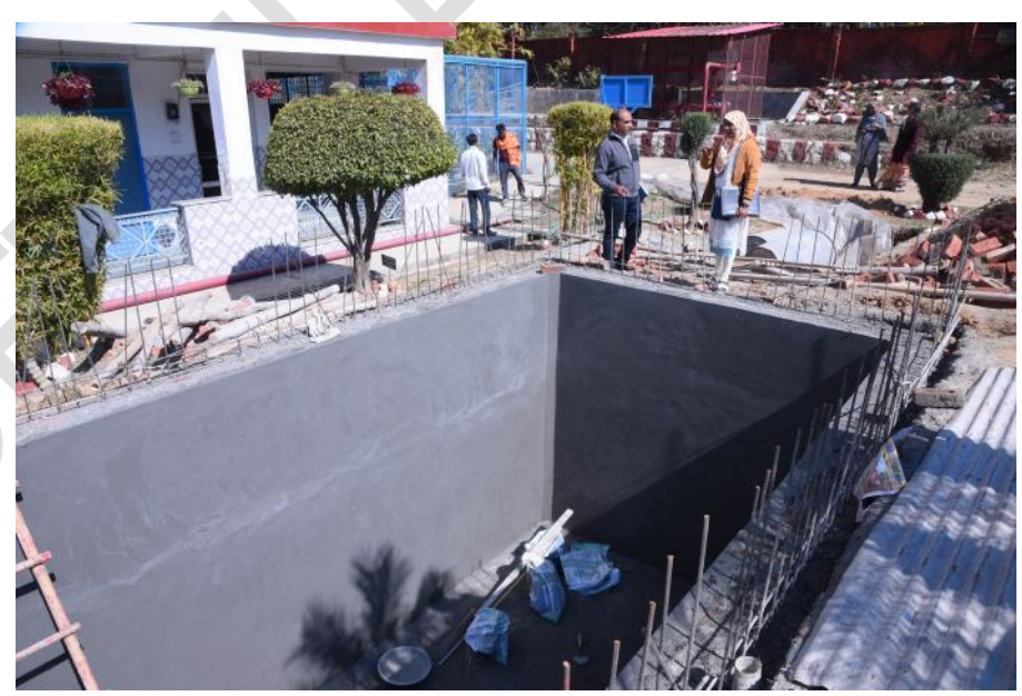
Plate 8: Rain water harvesting pits in the premises

The tertiary source of water is <u>the source of water harvesting</u>. There are recently <u>developed water pits available in the premises in 4 nos</u>.