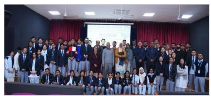
Plate 3: Seminar on subject related to Sustainability for the stakeholders

Note: The text mentioned in this type of font (red colour, bold and italics style) determines a suggestion