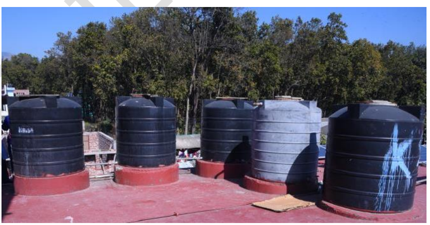
Plate 6: Overhead water tank in the premises

The study suggests that the space requires of tanks can be documented with Mention of size; Capacity usage; Institute name; Colour coding; Last maintenance date mentioned on each facility