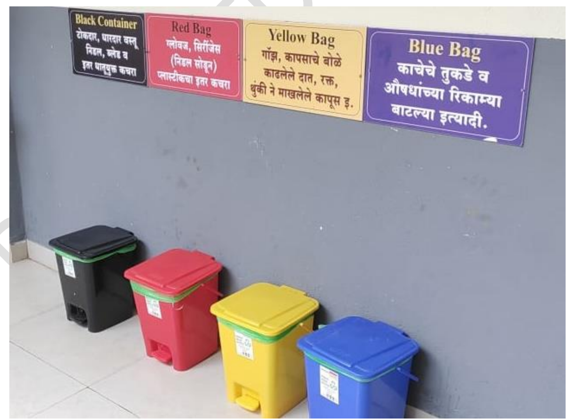
Reference suggestions 1: Twin litter dustbins in the premises

→ Multi-colored waste management bins - There should be more number of dual litter dustbins at various locations in areas such as Canteen, and open spaces. This would inculcate the awareness of waste segregation among students. Whereas a single type of dry waste dustbin should be available inside the teaching areas.