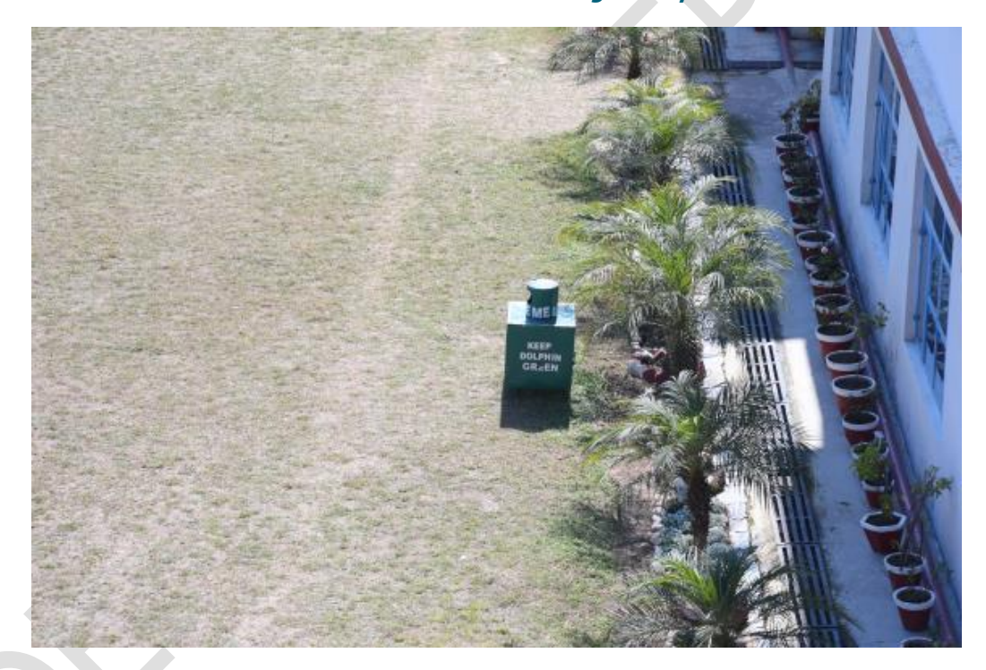
Plate 5: Vermicompost area within the premises

The study suggests that the area and quantity is fine, however a manual on display that highlights details about the process would add on to stakeholder sensitization.